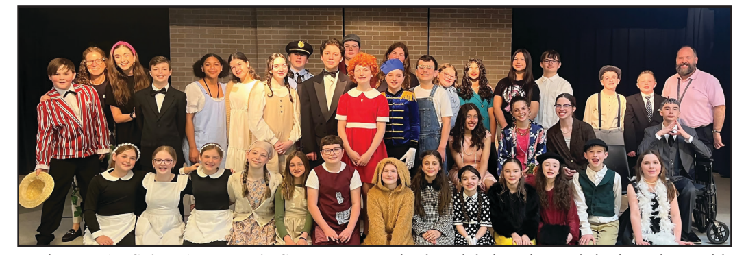
Students at All Saints Academy in Scranton recently shared their acting and singing talents with family, friends and the community by performing "Annie Kids," based on the musical "Little Orphan Annie."