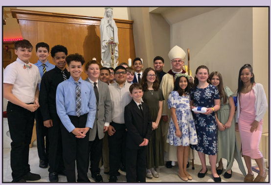
Holy Family Academy in Hazleton