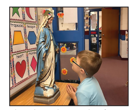
Throughout the month of May, students in La Salle Academy in Jessup celebrate the Blessed Mother by creating their own crowns for Mary and crowning her each morning during a prayer service.