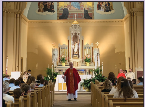
Holy Rosary School in Duryea