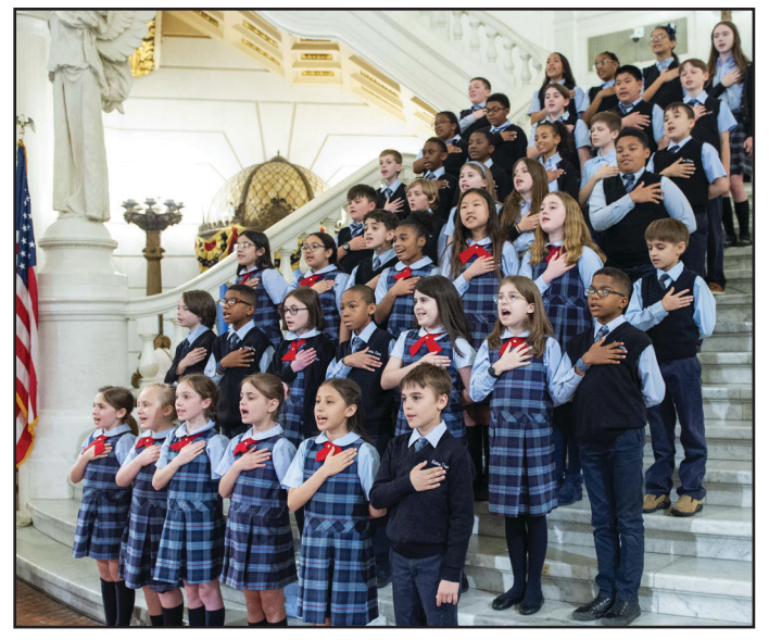
The fourth and fifth grade students at Notre Dame Elementary School in East Stroudsburg visited the Pennsylvania State Capitol Complex in Harrisburg, entertaining and inspiring the crowd with patriotic songs from the main staircase.