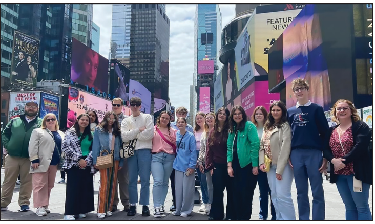
Members of the Theater Ensemble at Holy Cross High School in Dunmore enjoyed a fabulous day in New York City, touring Times Square, watching a performance of Wicked at the Gershwin Theater, and enjoying dinner and the show at Ellen's Stardust Diner.