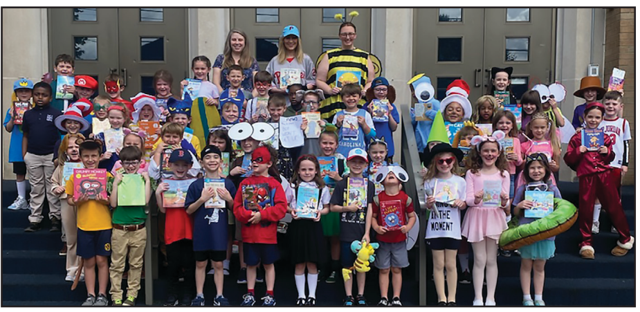
The first grade classes at Good Shepherd Academy in Kingston celebrated in style by dressing like their favorite storybook character.