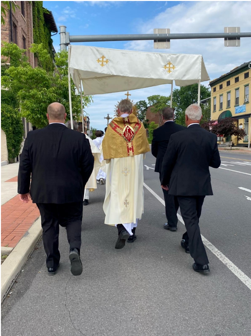
On the Feast of the Most Holy Body and Blood of Christ (Corpus Christi Sunday), many parishes around the Diocese of Scranton held processions in conjunction with the ongoing National Eucharistic Revival.