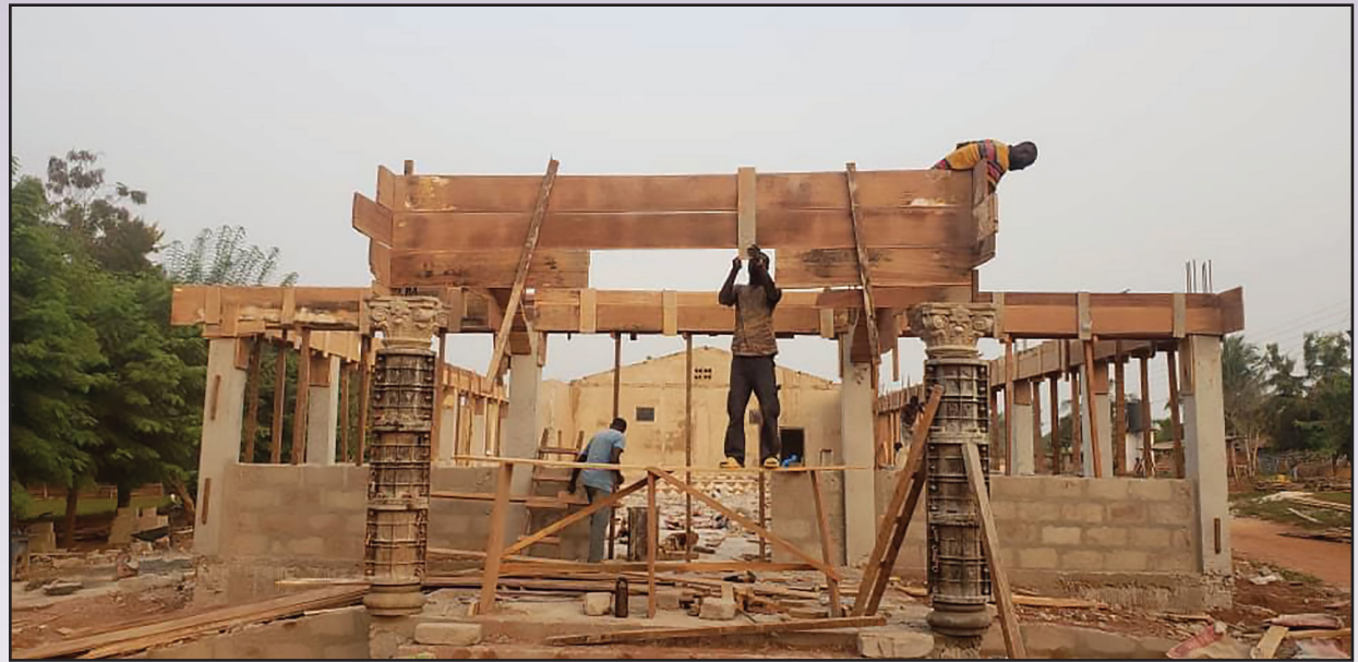
Generous donations from parishioners of Saint John the Evangelist Parish in Honesdale have provided essential funding for a new church building project in the Diocese of Sunyani, Ghana.