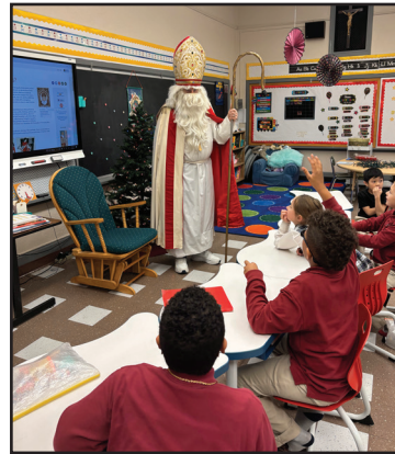
Students from Saint Nicholas/Saint Mary School in Wilkes-Barre received a visit from their patron, Saint Nicholas on Dec. 6, 2024. On his visit to each classroom, he reminded them of the importance of sharing. Learn more about all the school offers at its Open House on Jan. 26, 2025, from 2-4 p.m.

“It reminds us that a lot of people don’t have money or houses and