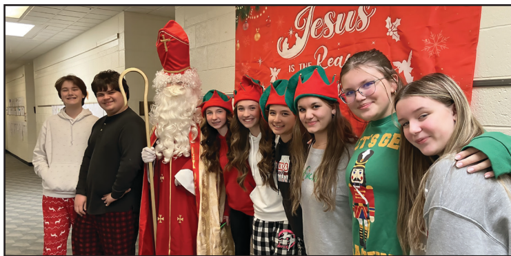
The students and faculty at Saint Jude School in Mountain Top received a special visit from St. Nicholas on his feast day; as he visited the school, he was thrilled to be accompanied by eighth grade elves. Learn more about all the school offers at its open house on Jan. 26 from noon to 2 p.m.