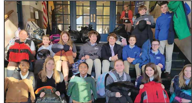
Service Club members at Saint Mary of Mount Carmel School in Dunmore proudly show some of the coats they collected this year to be donated to Friends of the Poor. Learn more about all the school offers at its open house on Jan. 26 from 11 a.m. to 1 p.m.