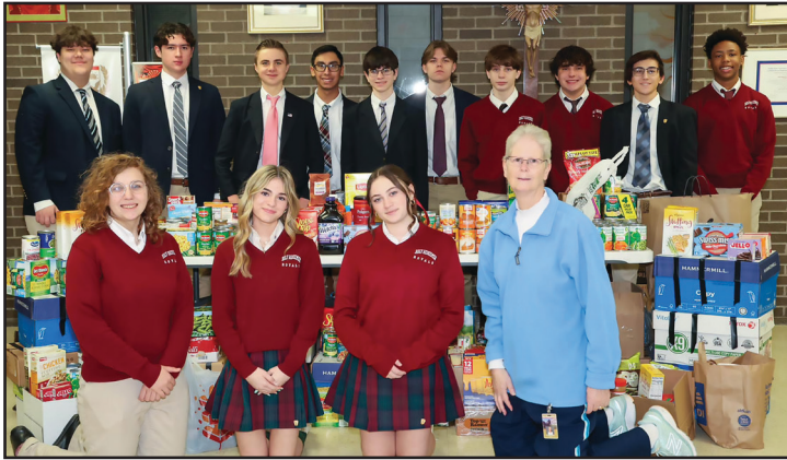
Saint Vincent de Paul Kitchen benefitted greatly thanks to the students and faculty at Holy Redeemer High School in Wilkes-Barre . Nearly 1,200 non-perishable items were collected so families could use them this holiday season.

The Diocese of Scranton is committed to educating our students in an environment that is academically excellent and facilitates the development of moral judgment and Christian decision-making. We are proud to share the following successes of our students in the classroom and in their service to others. Each day, our schools are fulfilling their mission of preparing today's youth and young adults to become tomorrow's faith-filled leaders.