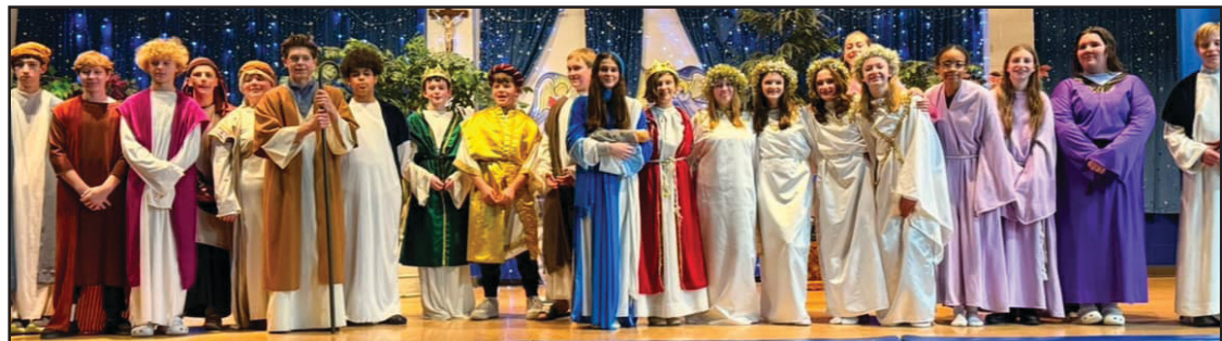
The eighth grade class at Wyoming Area Catholic School in Exeter presented "The Nativity" as part of the school's Christmas concert for families.