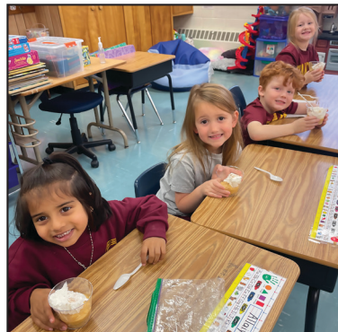
Kindergarten students at Saint John Neumann Elementary School in Williamsport learned how to make and enjoy pumpkin pie just in time for Thanksgiving.

Learn more about all the school offers at its open house on Jan. 26 from 1 to 3 p.m.