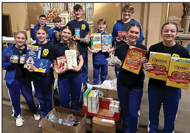
Students and families of Holy Rosary School in Duryea partnered with Nativity of Our Lord Parish to make sure the less fortunate in the greater Pittston area have food to eat during the winter months.