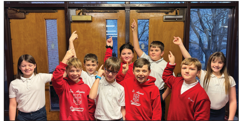
Students from Saint Agnes School in Towanda want everyone to notice that they blessed the school doors when they returned from Christmas break. The chalk inscription includes the letters "C," "M" and "B" representing the three Magi and the current year of 2025.