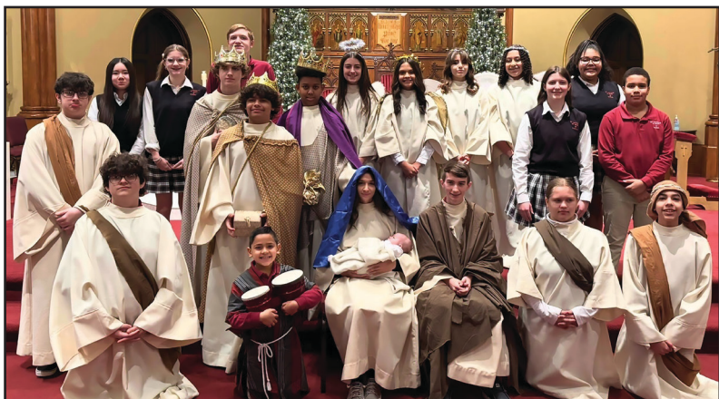
Eighth grade students at Saint Nicholas/Saint Mary School in Wilkes-Barre shared their talents while performing The Living Nativity just before their Christmas break.

The Diocese of Scranton is committed to educating our students in an environment that is academically excellent and facilitates the development of moral judgment and Christian decision-making. We are proud to share the following successes of our students in the classroom and in their service to others. Each day, our schools are fulfilling their mission of preparing today's youth and young adults to become tomorrow's faith-filled leaders.