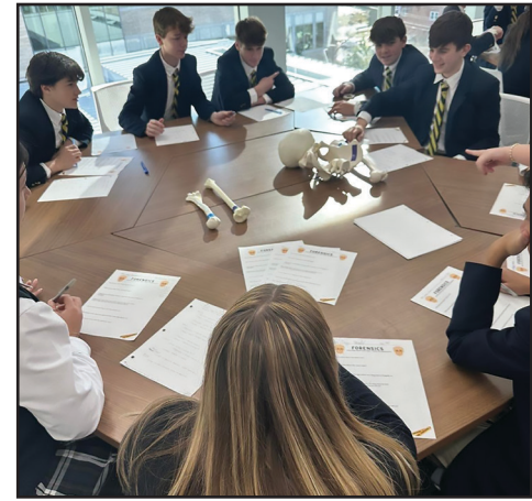
Eighth grade students from Saint Clare/Saint Paul School in Scranton had an opportunity to visit the Geisinger Commonwealth School of Medicine. They learned more about the skeletal system and careers that work directly with our bones and mobility. Workshops included hands-on activities introducing the skeletal system, understanding forensic science, and using X-ray images to learn about breaks and fractures.