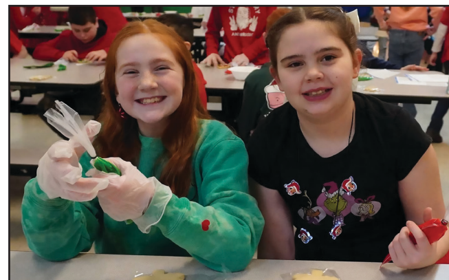
What's better than decorating a cookie, eating tasty snacks, posing in a photo booth with Santa, taking a chance to win a raffle basket, and dancing the day away? Nothing, if you ask the students at All Saints Academy in Scranton who had the best time at the school's Christmas Carnival.