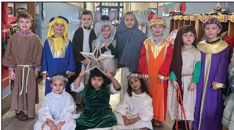
The kindergarten class at Saint Mary of Mount Carmel School in Dunmore presented The Living Nativity just before their Christmas break.

Students and their families from Wyoming Area Catholic School in Exeter supported the "Greater Pittston Area Shop with a Cop" during the holidays to support the program which helps families in need to receive toys for their children at Christmas.