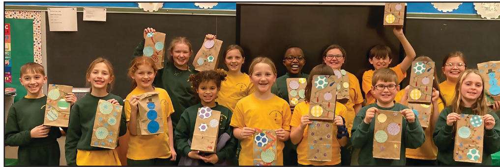
The Maker Club from Epiphany School in Sayre crafted hand-made Christmas ornaments, desk calendars, and cards for shut-ins of the Epiphany Church community as part of a three-month service project.