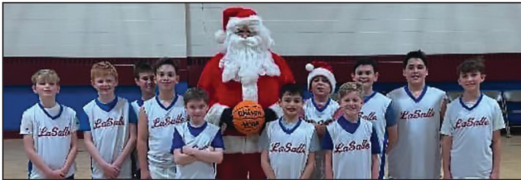
The fourth & fifth grade boys' basketball team at La Salle Academy in Jessup spent time off the court spreading Christmas joy. They made cards and sent Christmas cookies to the priests at St. Mary's Villa. Santa was watching all their good works and made a surprise appearance at the end of one of their practices to thank them for keeping the true spirit of the holiday.